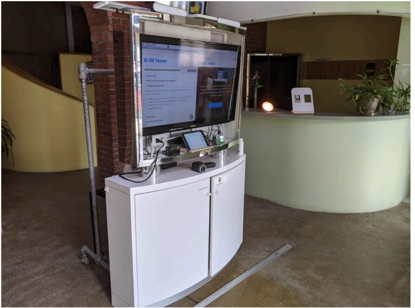
Safety Kiosk Early Prototype